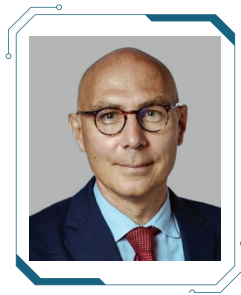
H.E. Mr. Volker Türk United Nations High Commissioner for Human Rights

Mr. Volker Türk ( Austria ) is the current United Nations High Commissioner for Human Rights. He has previously held senior positions at the United Nations in the Executive Office of the Secretary-General and the Office of the High Commissioner for Refugees, both at its Headquarters in Geneva and in field offices around the world”