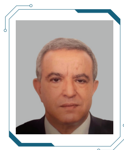
H.E. Mr. Mohamed Aujjar Chair of the Session Former Minister of Justice - Morocco