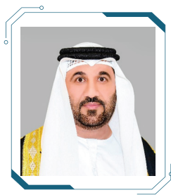
H.E. Mohammed Ahmed Al Yamahi Chairperson of the Arab Parliament

Fluent in five languages, she previously served as Morocco’s Ambassador to Sweden and Latvia and as SG of the International Federation for Human Rights. She has been an influential member of several human rights committees and groups and was the first woman elected to chair a major human rights NGO in Morocco.